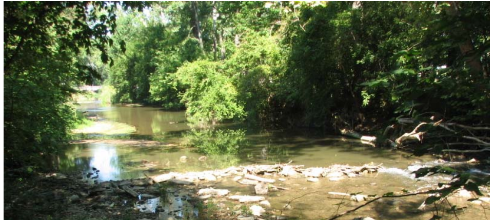
Trace ruins of Feeder Dam 7 in the West Fork of the Whitewater River, Cambridge City, Ind. (2007)