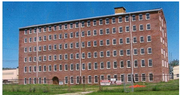
Now look at this. This is a photo of the CEC building, the old Furniture Factory on the Whitewater Canal in Connersville. Some remember it as the Roots Blower Works building. Today when I see it I think... That's a lot of bricks! Some local man bid on the contract to make those bricks!

You see, at that time there was a great demand for bricks. Each of these facilities had a capacity of creating one and a half million bricks per year. And