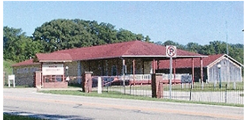
The former MacLyn Campground at Metamora now belongs to the Whitewater Canal Byway Association. It will become the Whitewater Valley Gateway Park.